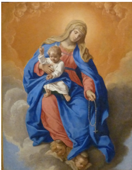
OUR LADY OF THE ROSARY