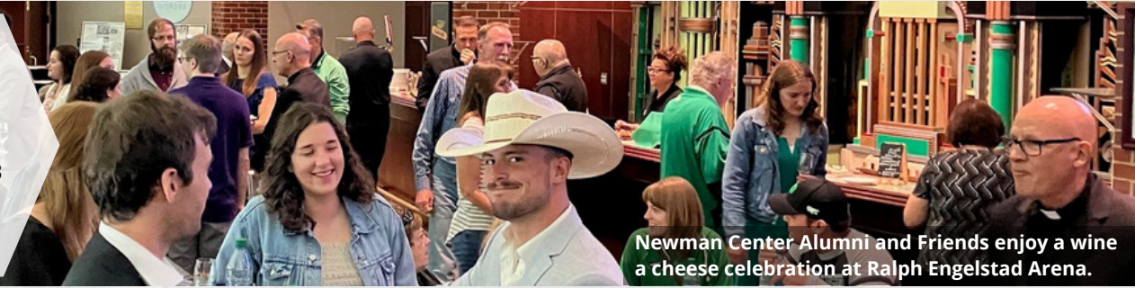
Newman Center Alumni and Friends enjoy a wine and cheese celebration at Ralph Engelstad Arena.