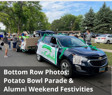
Bottom Row Photos: Potato Bowl Parade & Alumni Weekend Festivities