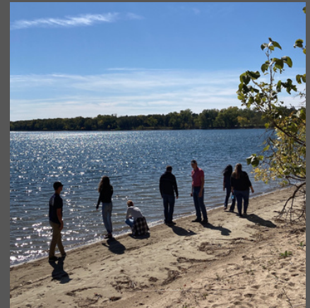
Retreat attendees take advantage of time to experience God's love through nature at Glendalough State Park

In the busyness of student life and never-ending search for the answer to "What will you do with your life?," the First Timer's Retreat helps students to have a true encounter with Christ and understand what's most important in life – building a lasting relationship with the Lord.