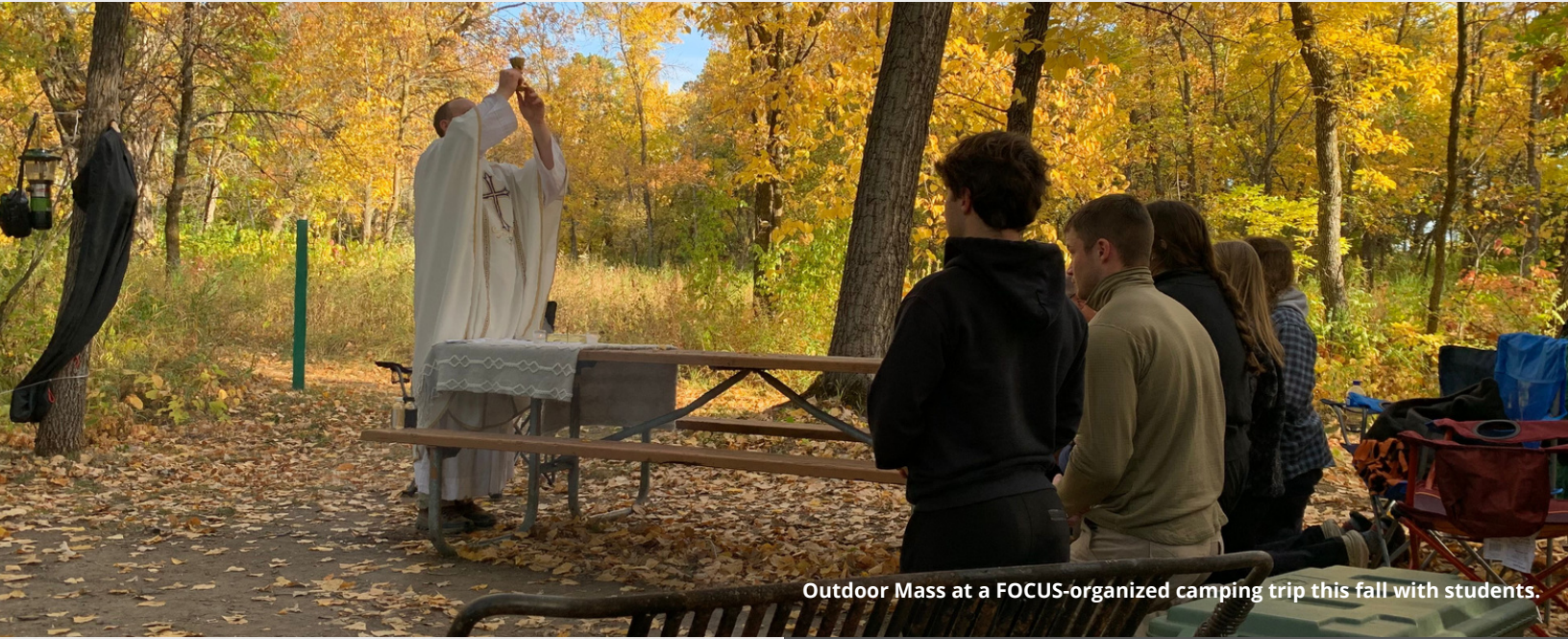
Outdoor Mass at a FOCUS-organized camping trip this fall with students.

St. Thomas Aquinas Newman Center - Fall Semester Newsletter - November 2022